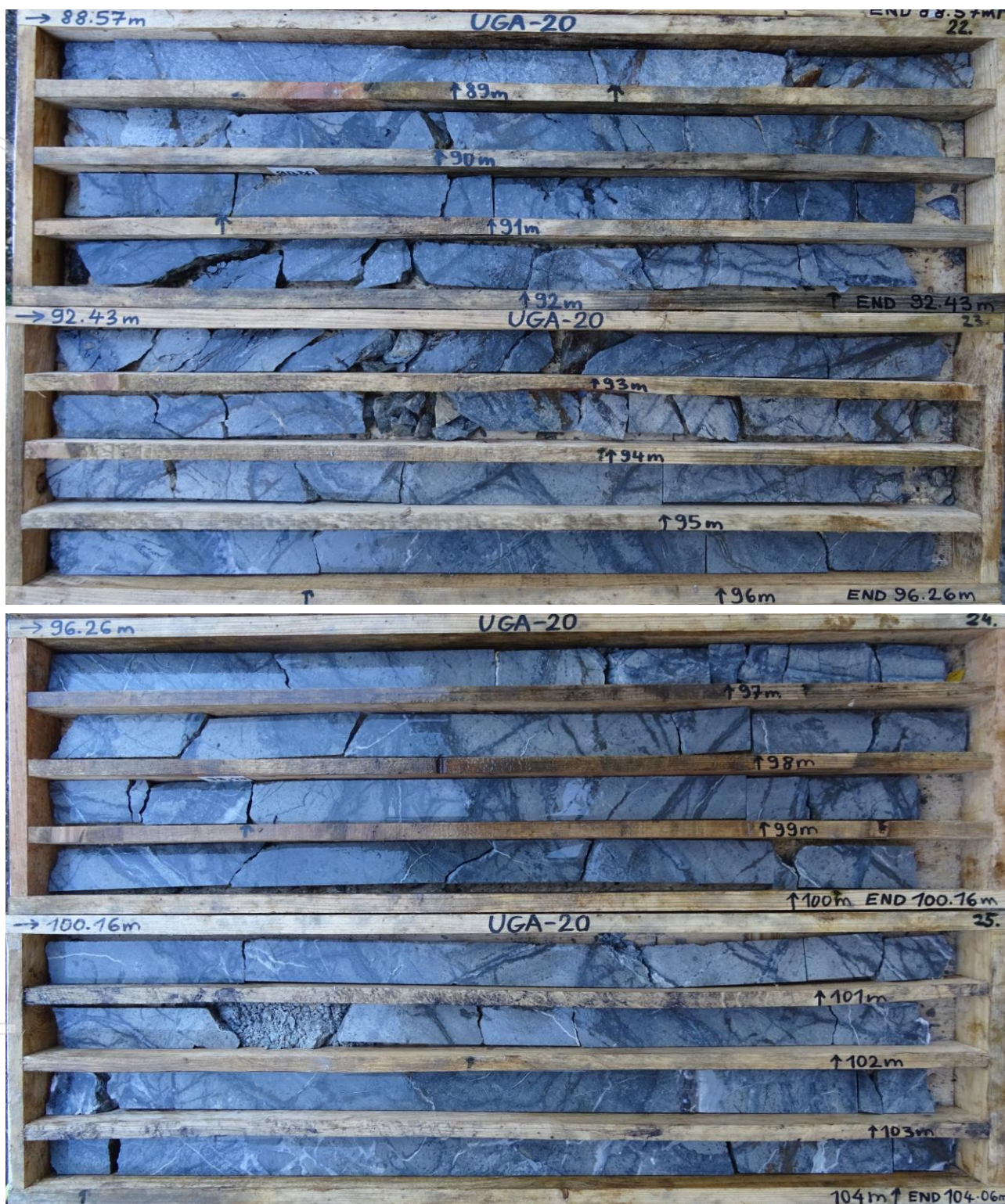
Figure 2: UGA-20 drill core; part of the interval from 75m to 120m (down-hole) showing quartz filled vein/stockwork/breccia structures, variably rich in fine to very fine grained sulphides (mainly pyrite/marcasite) and hosted within strongly argillic altered andesite host rock. Traces of visible gold identified at 97.6m

** This announcement is authorised by the executive board on behalf of the Company **